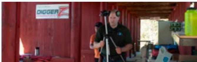
Copyright © 2016 Hay River Shooting Club